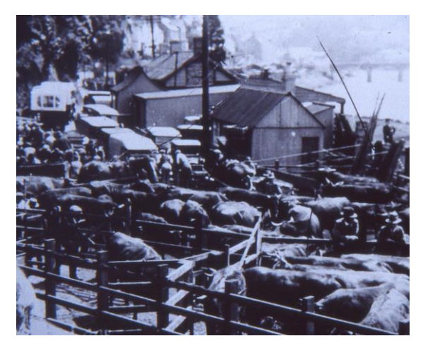
Cattle Market, Looe Station c 1925.